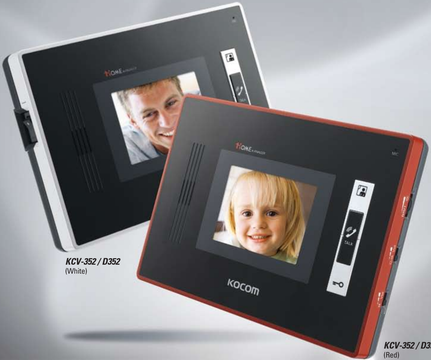
KCV-352 / D352 (White)